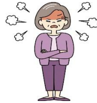
Past President Ass. Director

Look who dropped in unexpectedly at our Christmas in July Party