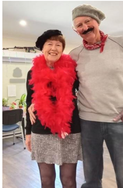
A couple of French gatecrashers